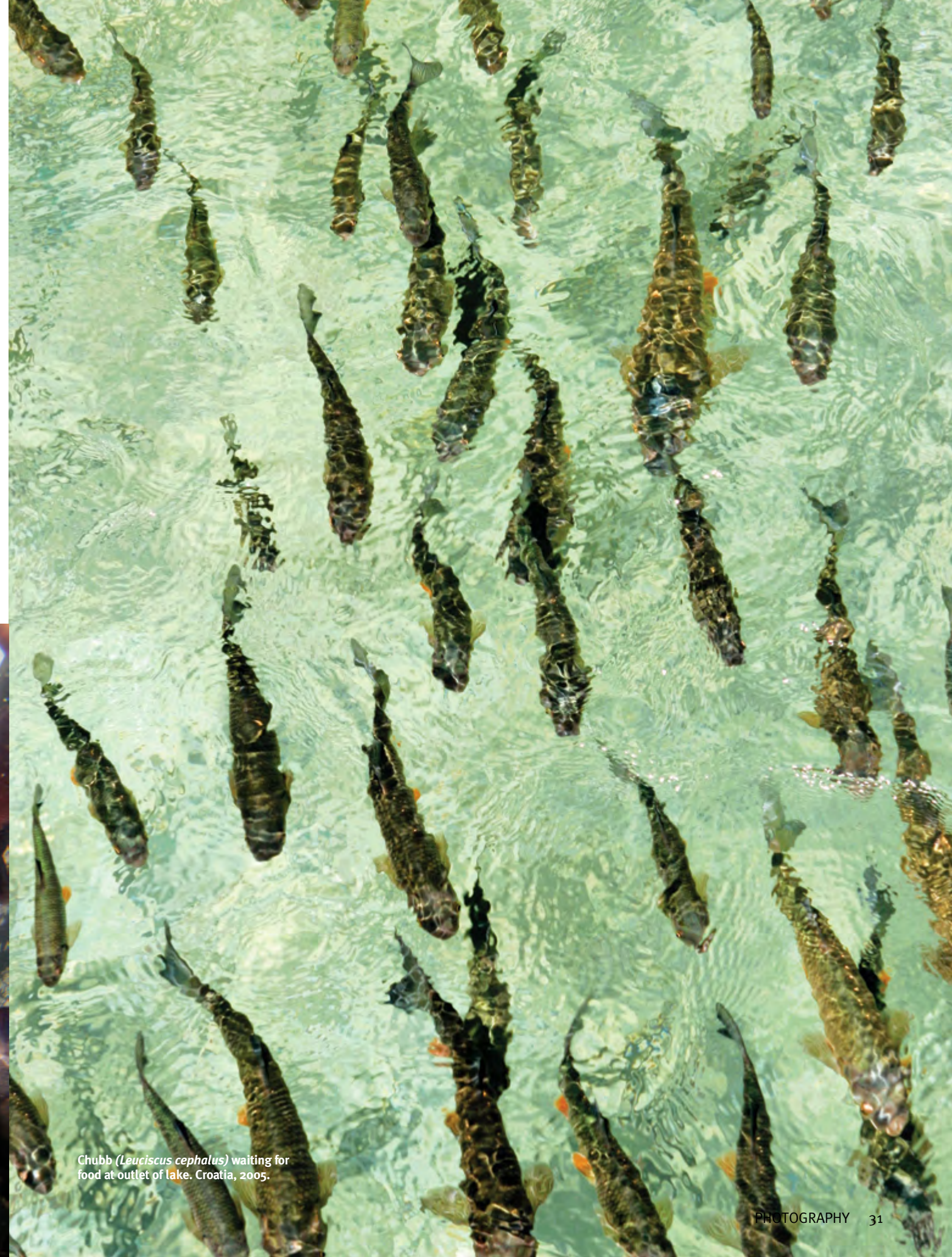
Chubb ( Leuciscus cephalus ) waiting for food at outlet of lake. Croatia, 2005.