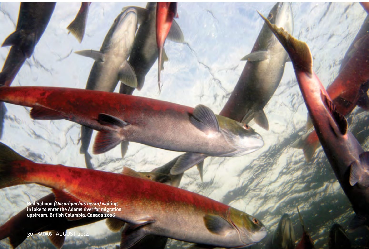
Red Salmon ( Oncorhynchus nerka ) waiting in lake to enter the Adams river for migration upstream. British Columbia, Canada 2006