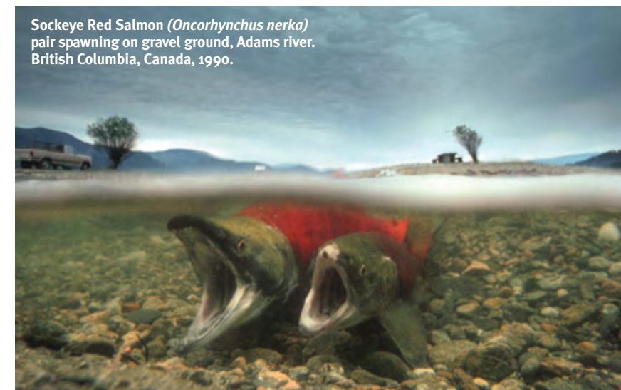
Sockeye Red Salmon ( Oncorhynchus nerka ) pair spawning on gravel ground, Adams river. British Columbia, Canada, 1990.

freshwater ecosystems; to take pictures of 30 special freshwater locations over four years, places that are spectacular, vital and very different from each other. I contacted some foundations and NGOs, but no one was interested in supporting it. I guess they were not really sure if it was even realistic to cover 30 locations around the world in four years. I realised I had just to start it without any help. The project developed quite well, and once I had photographed 15 or so locations, there was more interest in the venture, along with some of the first publications. It was only then that the IUCN contacted me to work on some sort of collaboration. In a sense, The Freshwater Project is still not an assignment, but a personal project, supported by the IUCN.