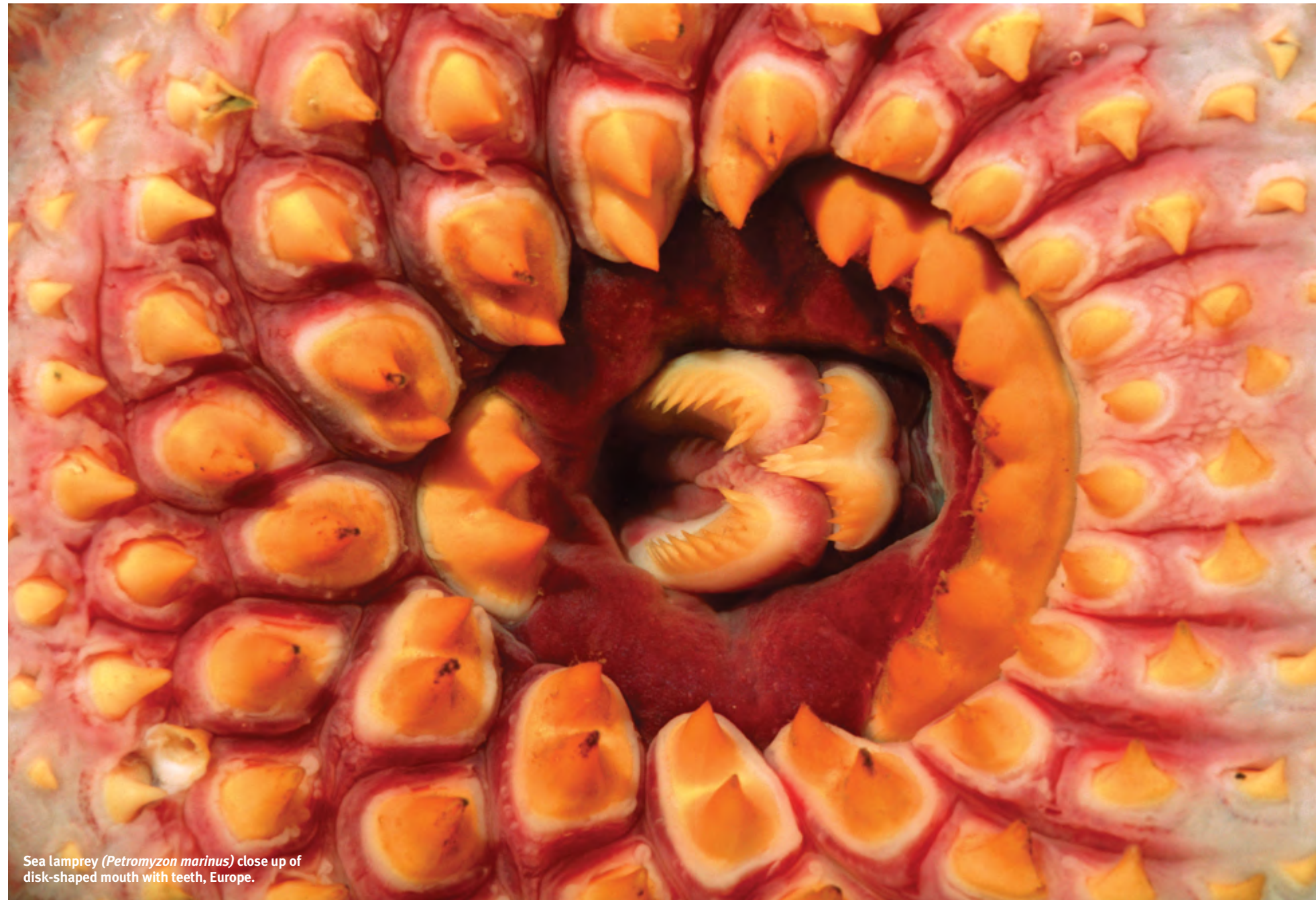
Sea lamprey ( Petromyzon marinus ) close up of disk-shaped mouth with teeth, Europe.