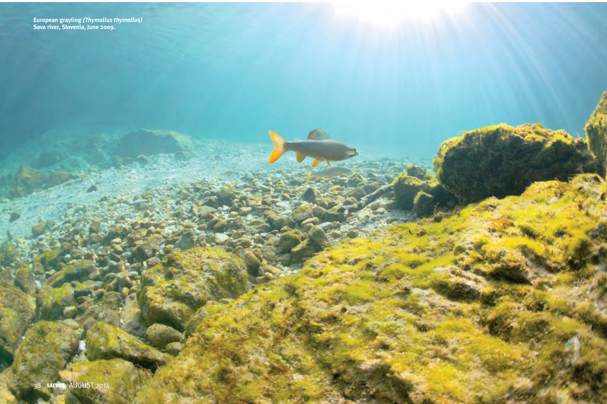
European grayling ( Thymallus thymallus ) Sava river, Slovenia, June 2009.

do it right. It is sometimes hard enough to get the images I'm looking for and sell enough copyrights to make a living. Perhaps, you have to work in a team for bigger ideas. I have been a member of the ILCP since about one year. You may take one look at the mission and values of this organisation to understand that this is something a photographer can never achieve alone.