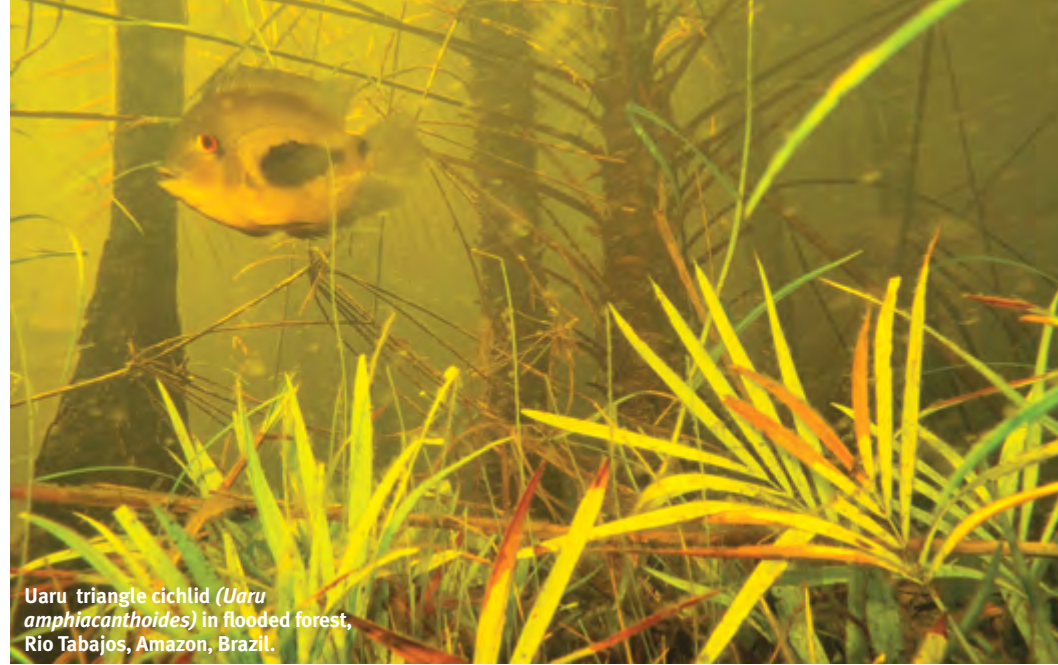
Uaru triangle cichlid ( Uaru amphiacanthoides ) in flooded forest, Rio Tabajos, Amazon, Brazil.

I'm afraid I may not to be the right person to answer this. But I clearly realise that times have changed: you cannot save the world alone like Bruce Willis. Of course, there are the benefits of social media, but this is time consuming if you want to