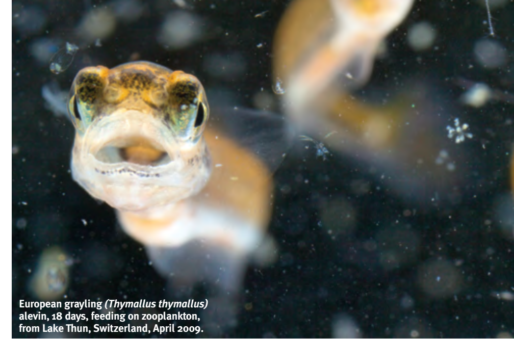
European grayling ( Thymallus thymallus ) alevin, 18 days, feeding on zooplankton, from Lake Thun, Switzerland, April 2009.