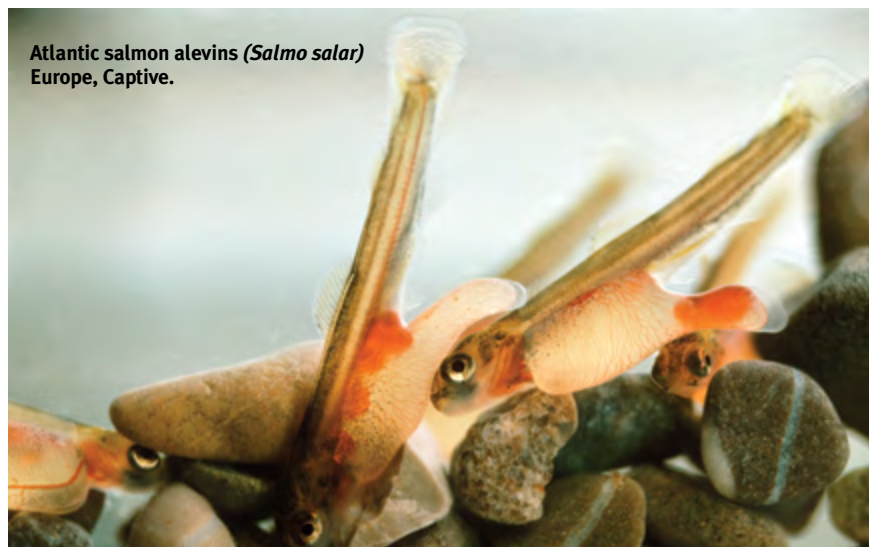
Atlantic salmon alevins ( Salmo salar ) Europe, Captive.