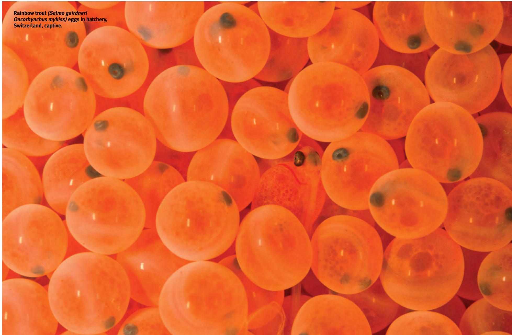
Rainbow trout ( Salmo gairdneri / Oncorhynchus mykiss ) eggs in hatchery, Switzerland, captive.

I did freshwater photography for about 25 years, travelling all over the world. Most of the time, I was after some interesting species of fish - salmon, for example - or ecosystems, such as the Amazon rainforest. Over the years, I gained experience in underwater photography in rivers, springs, flooded forests, swamps, wetlands, and such, and at one moment, I started thinking about a big project which could use these images. Pretty soon I had this idea of working across the globe on